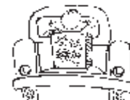
kids aren't cargo

Passengers under 18 may not ride in the back of a pickup or flatbed truck. This does not apply, however, to farming and ranching activity, parades or to camper shells or slide-in campers. (NRS 484B.160)